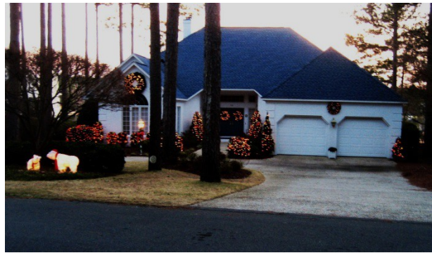
Shaughnessey – Road-Side 1st Place