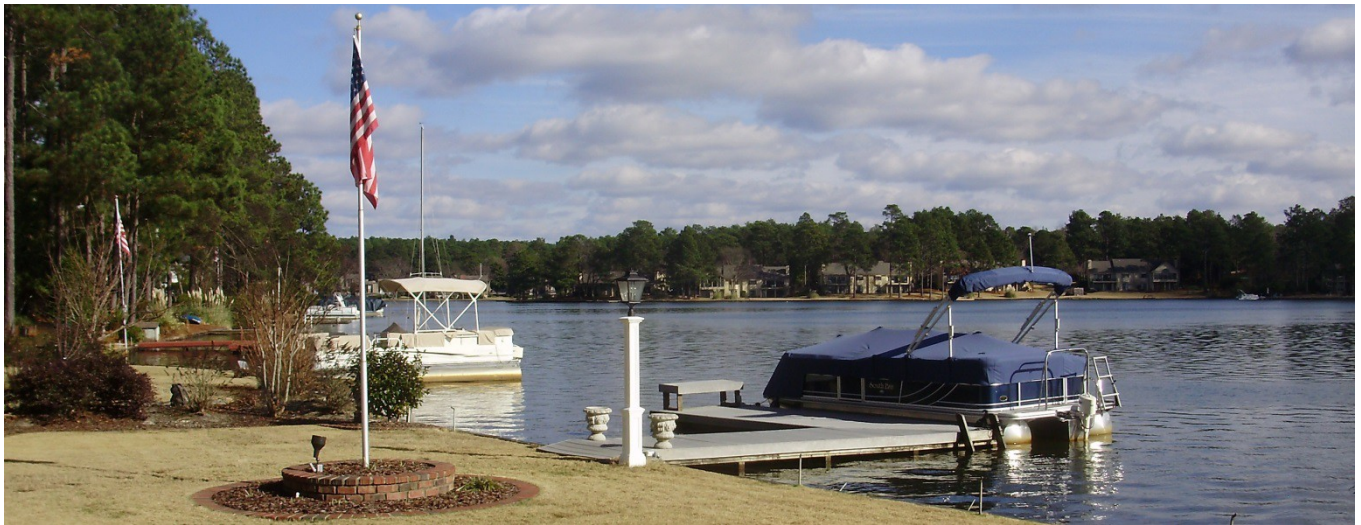
Buttomed Up For The Winter