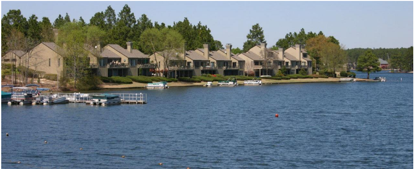
Lake Pinehurst Villas