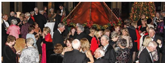
Socialize at the Cocktail Party

Look for your formal invitation in the mail soon with replies due by December 1.