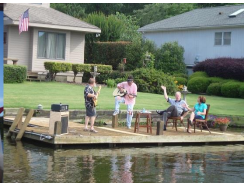
Dockside Entertainment