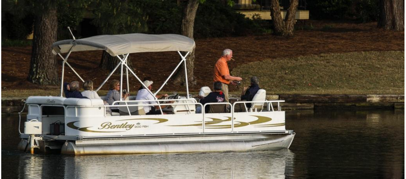
Fishing with lots of Witnesses to verify catching the big one.