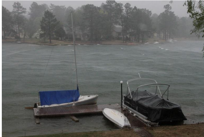
Wind and heavy rain on the lake

Rain: We have had so much rain in the month of June that it's a good time to turn off your irrigation systems if you have not already done so. The lake level is very high so many of the shoreline grasses are submerged at this time and the carp may be coming closer to your bulkheads now. You may see more snakes closer to your bulkheads too or sunning themselves in your gardens (when the sun does come out). We do have poisonous snakes in Lake Pinehurst so beware when you are gardening or walking in your yard.