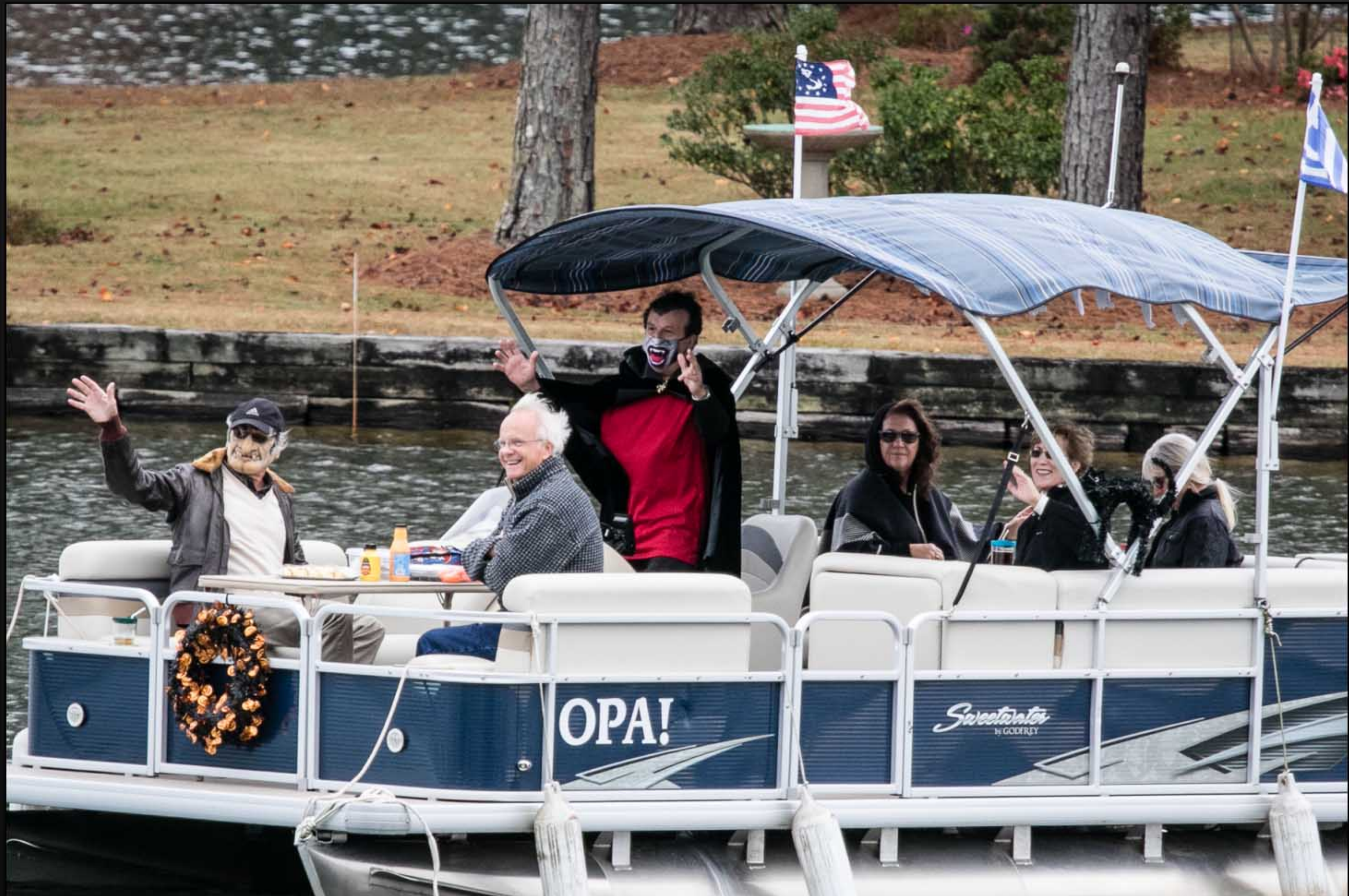
Is that a vampire or the Count of Monte Pinehurst?