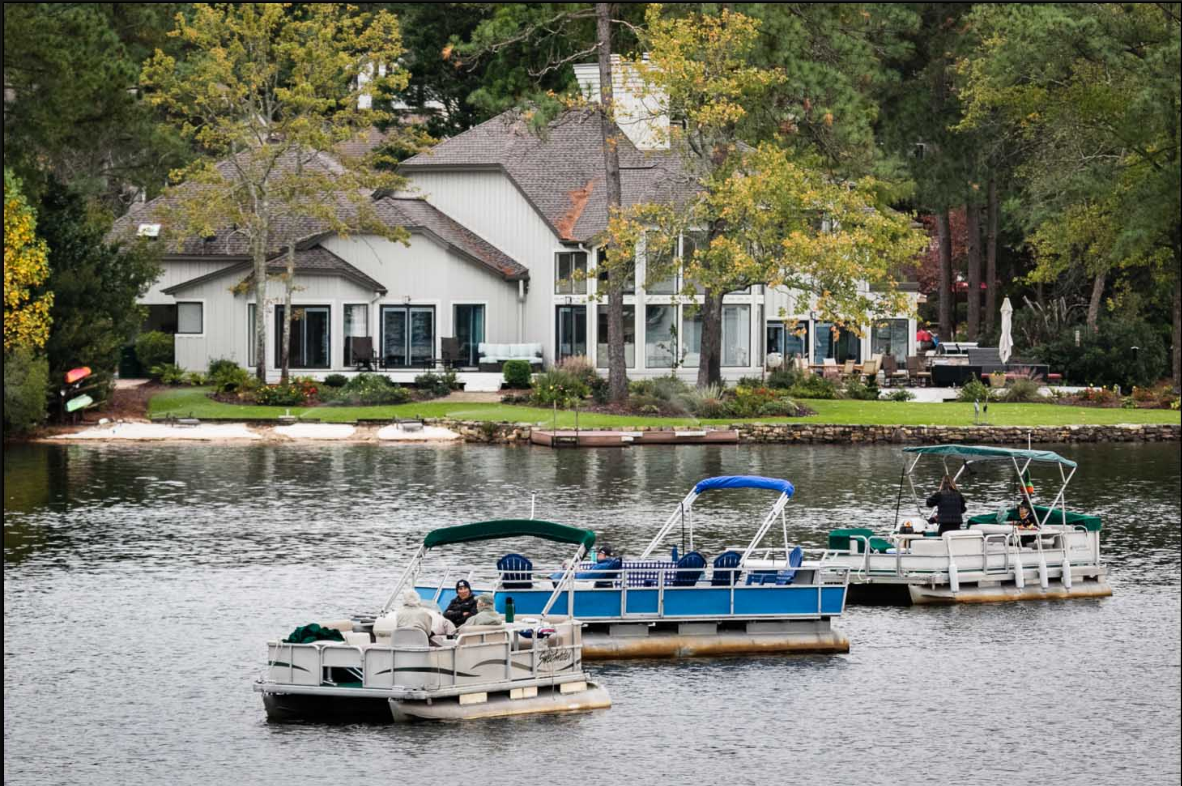
More boats, all dressed for warm weather as the trees change color