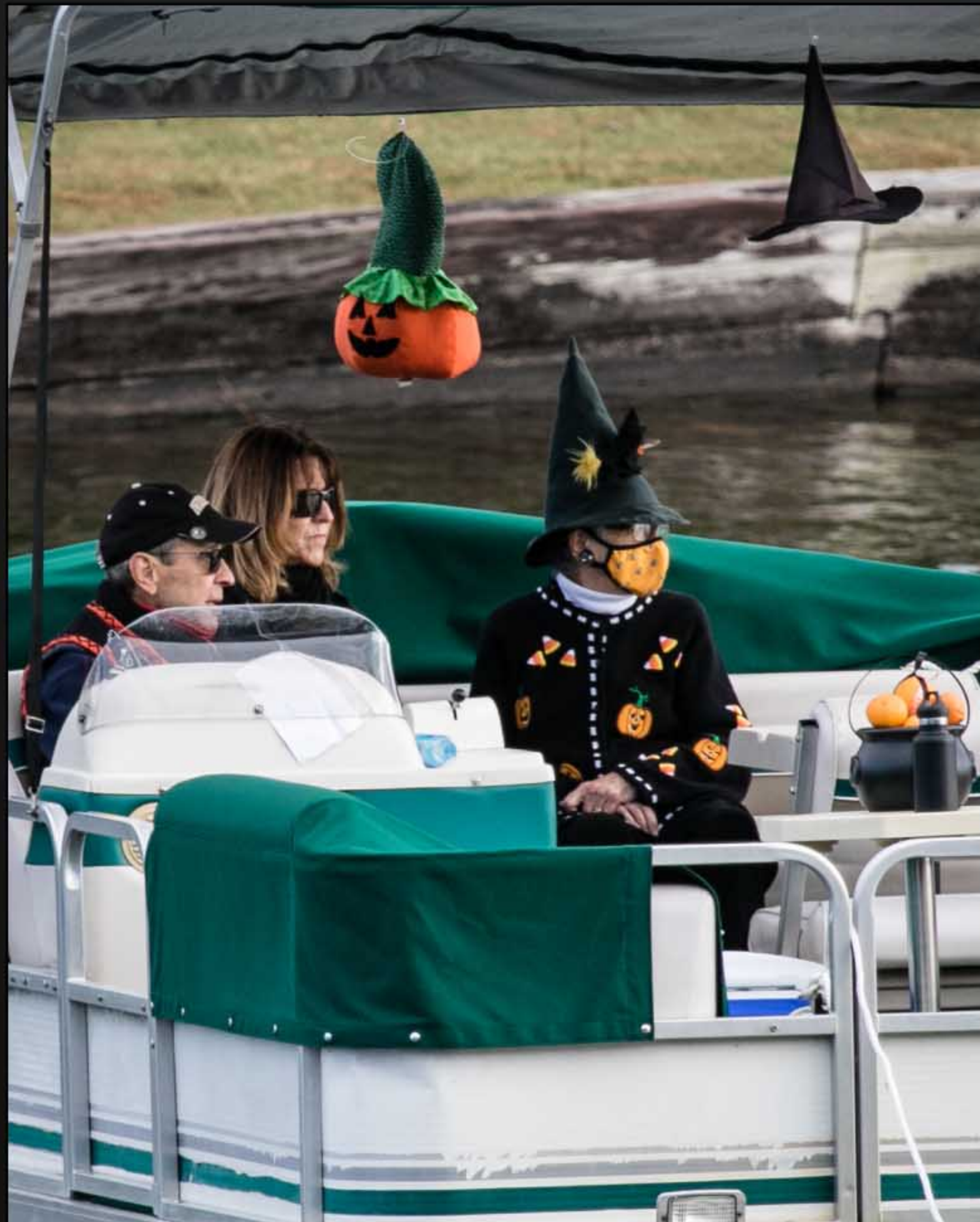
What is Halloween without the resident wonderful witch