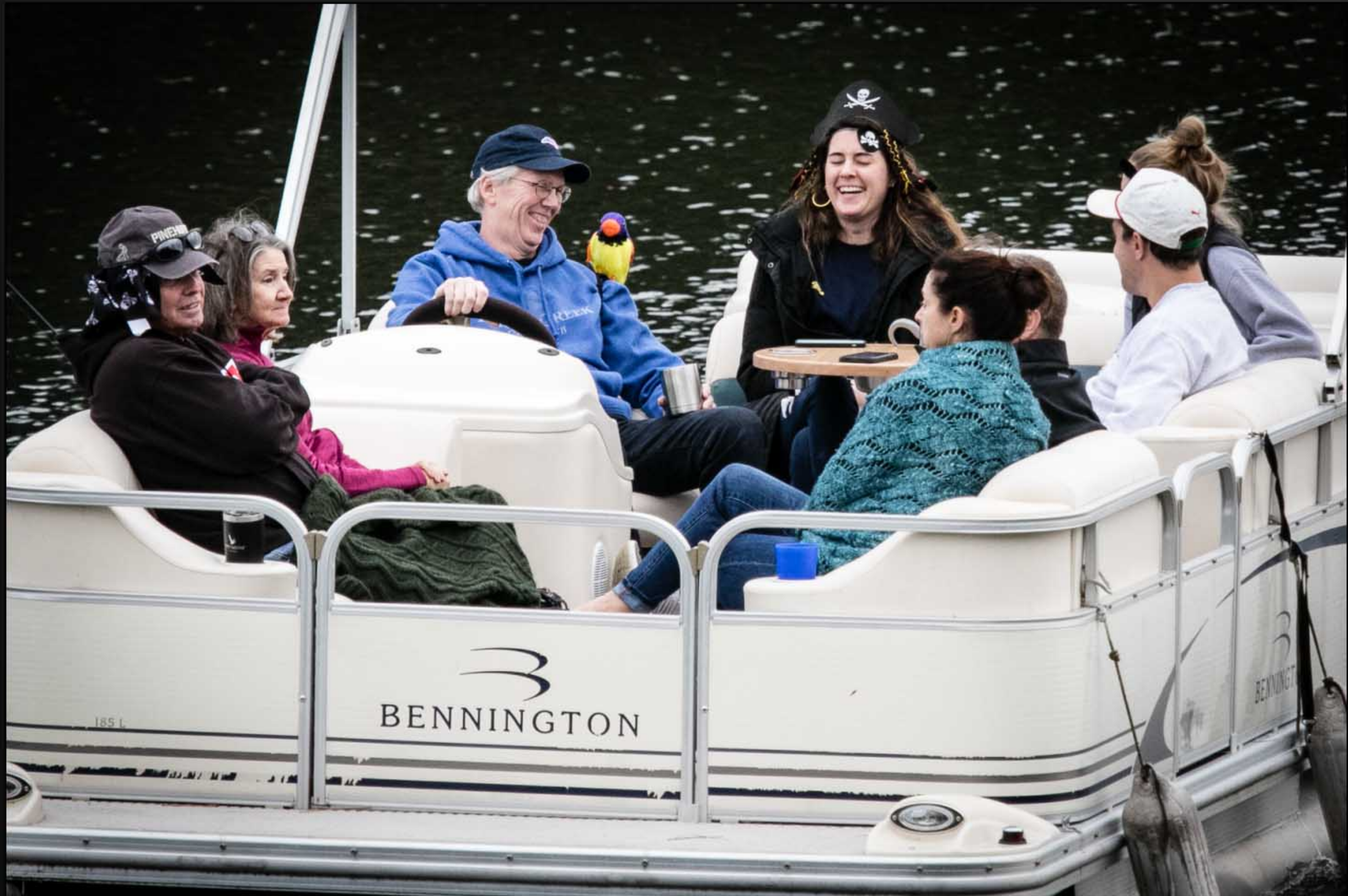
There is that parrot again or is it just someone in costume?