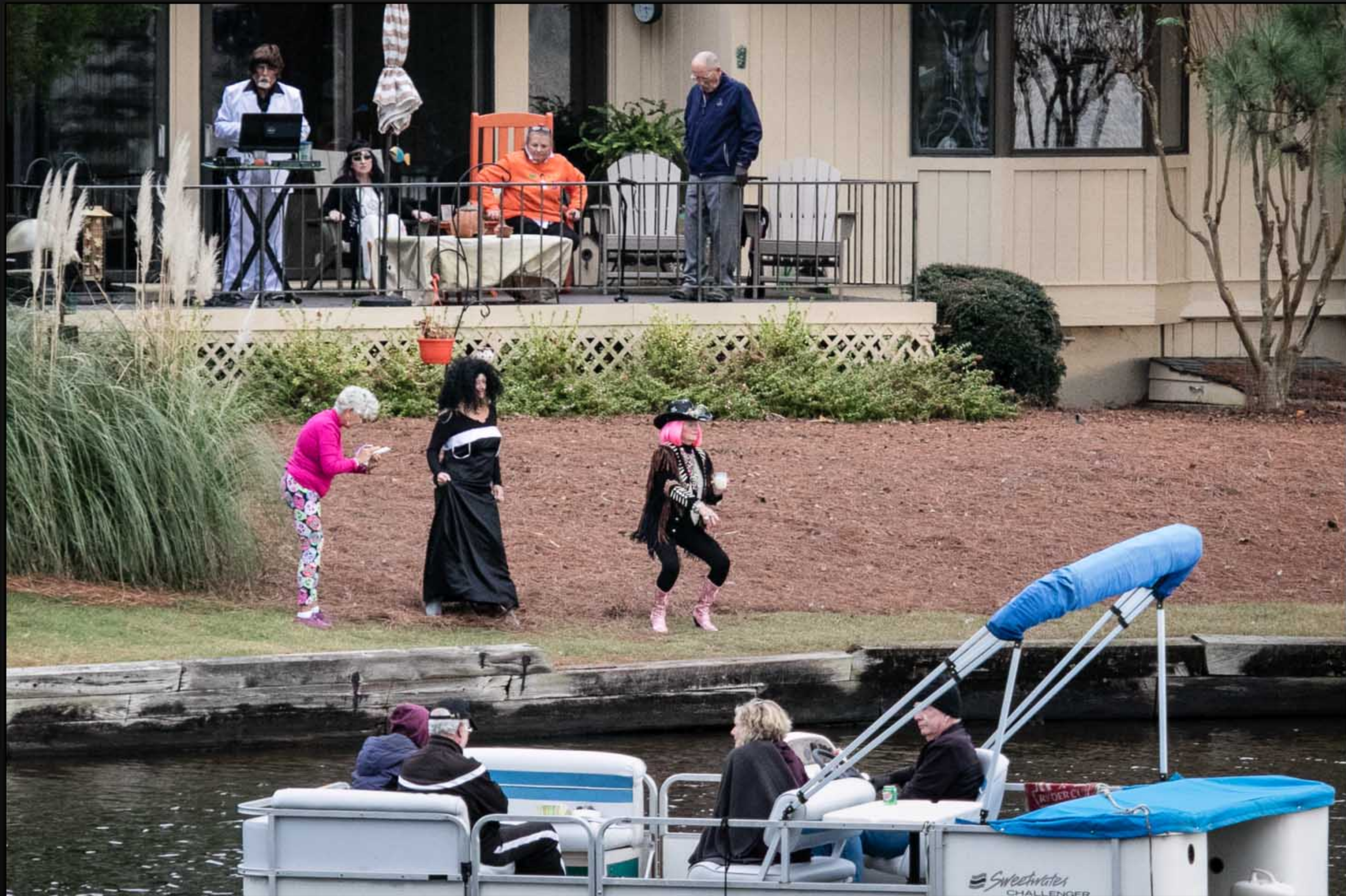
...and shakin and bakin!