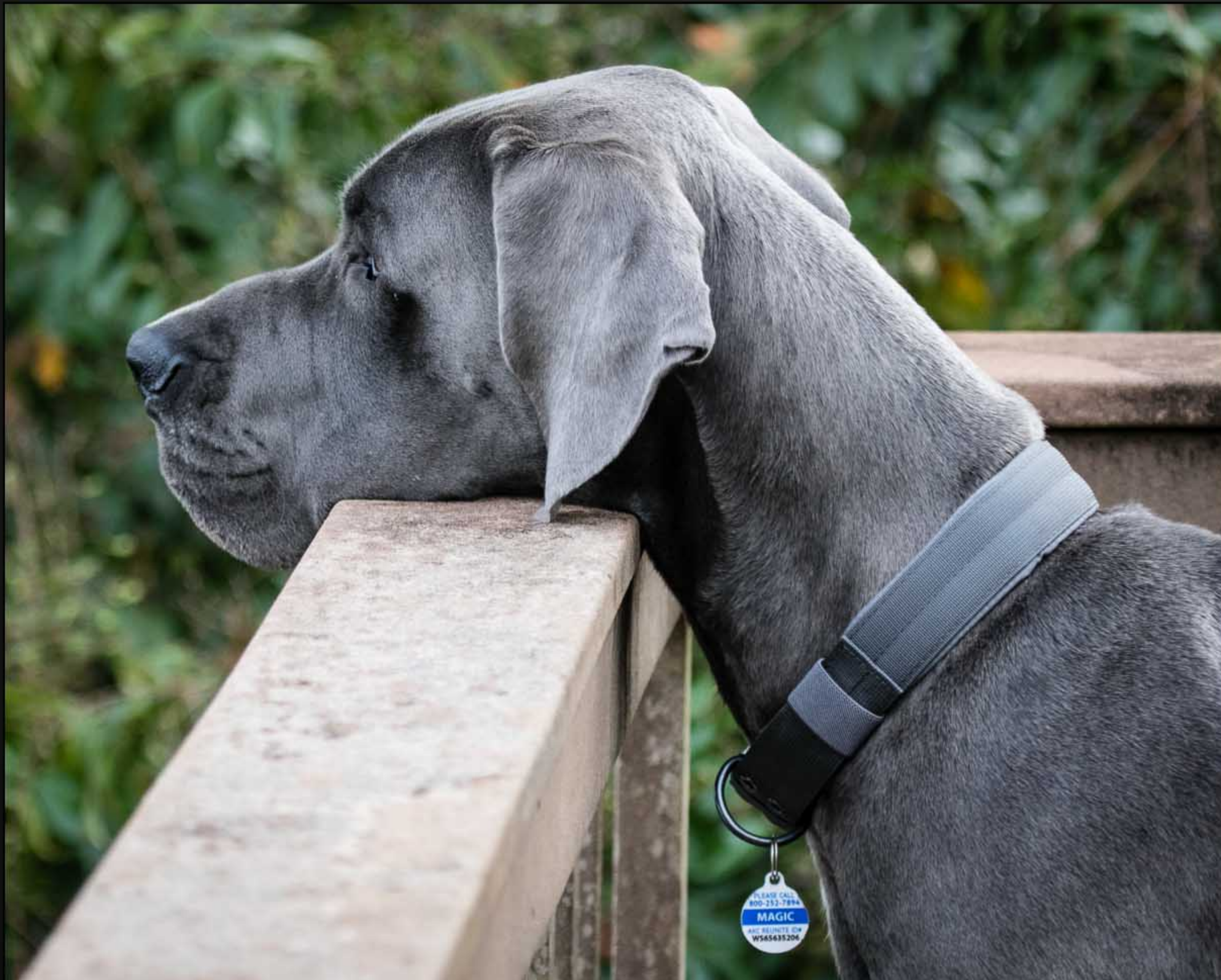
"Blue Magic" has his favorite location and is ready for the music