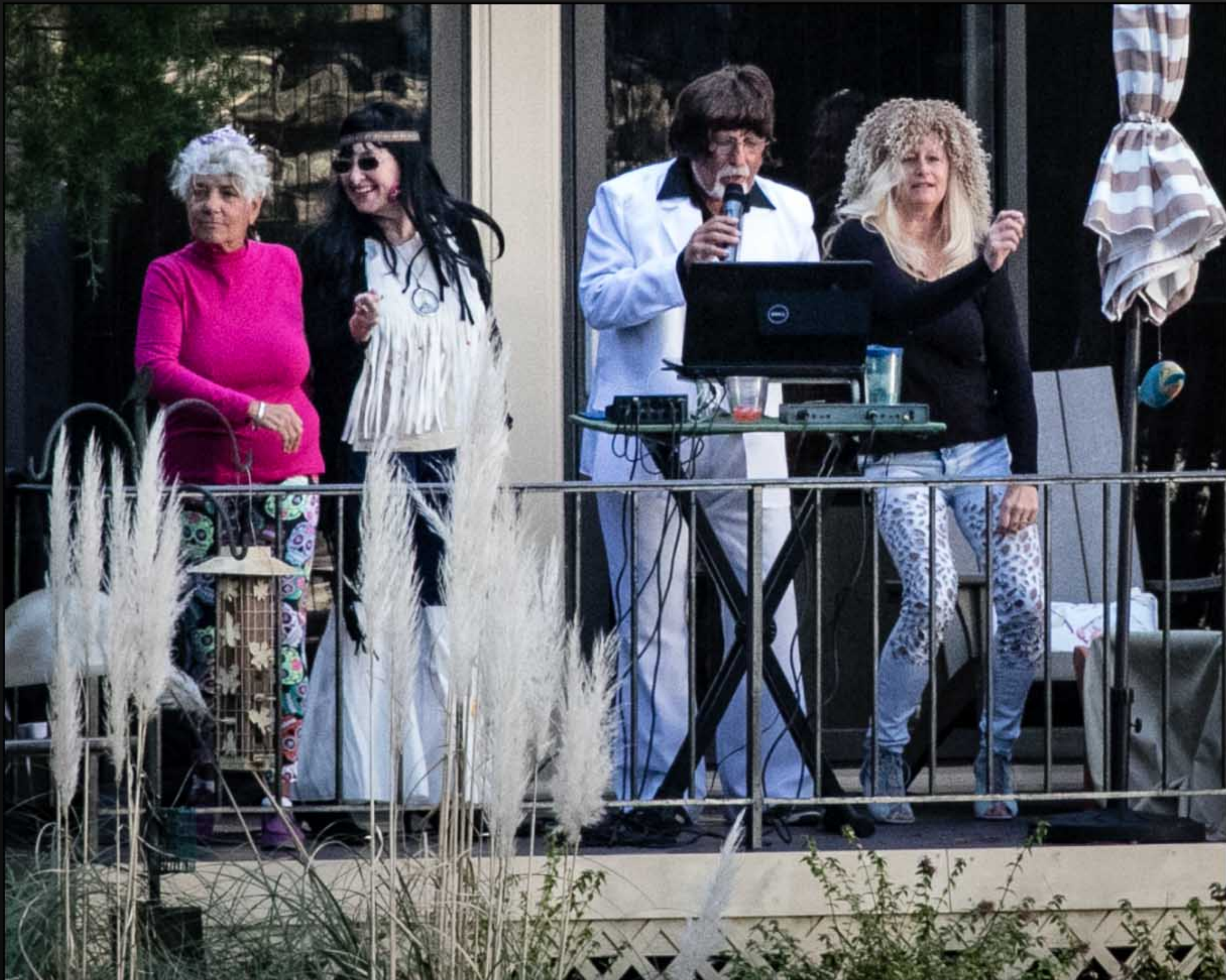
The concert is beginning to wind down