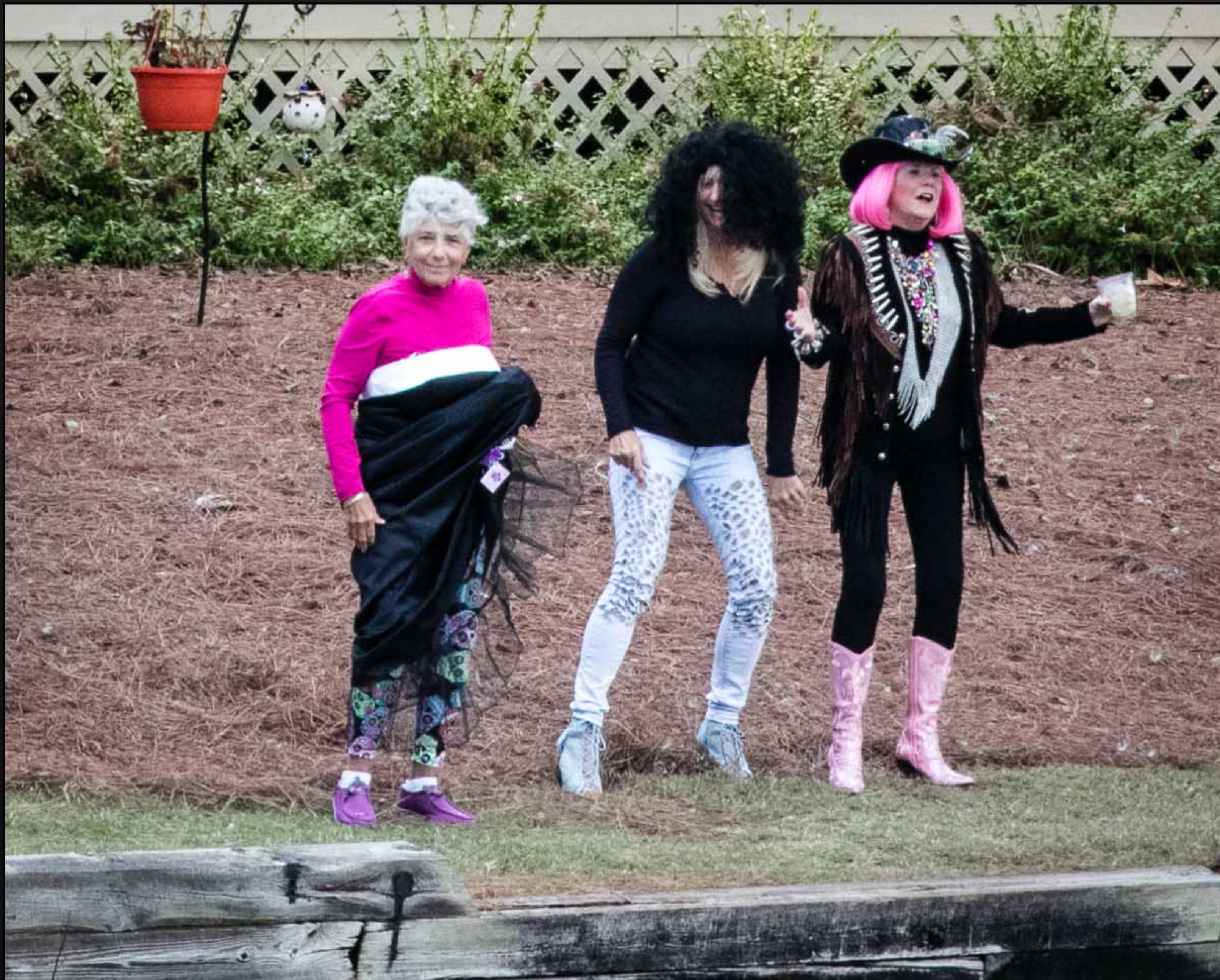
These ladies really got the boats rockin and rollin...