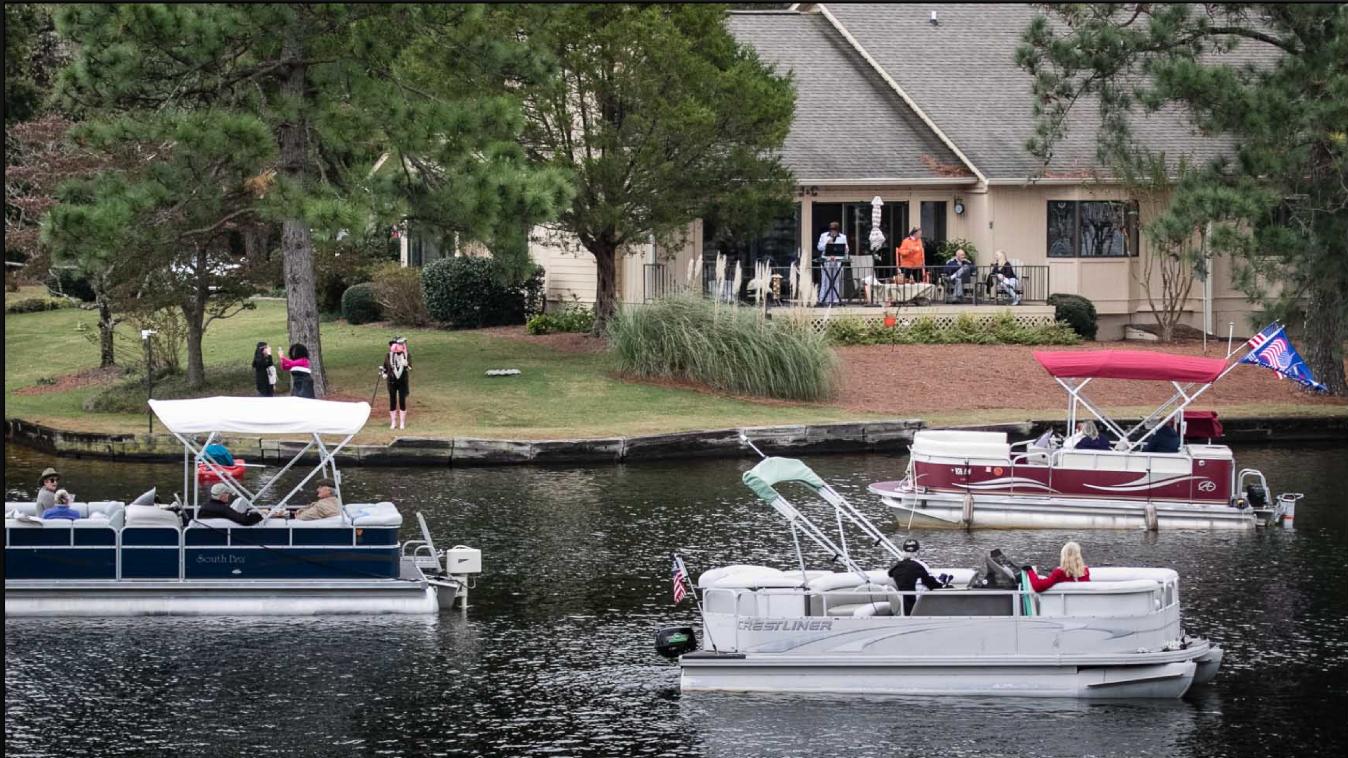
These are few of the 20 boats that came to listen and enjoy