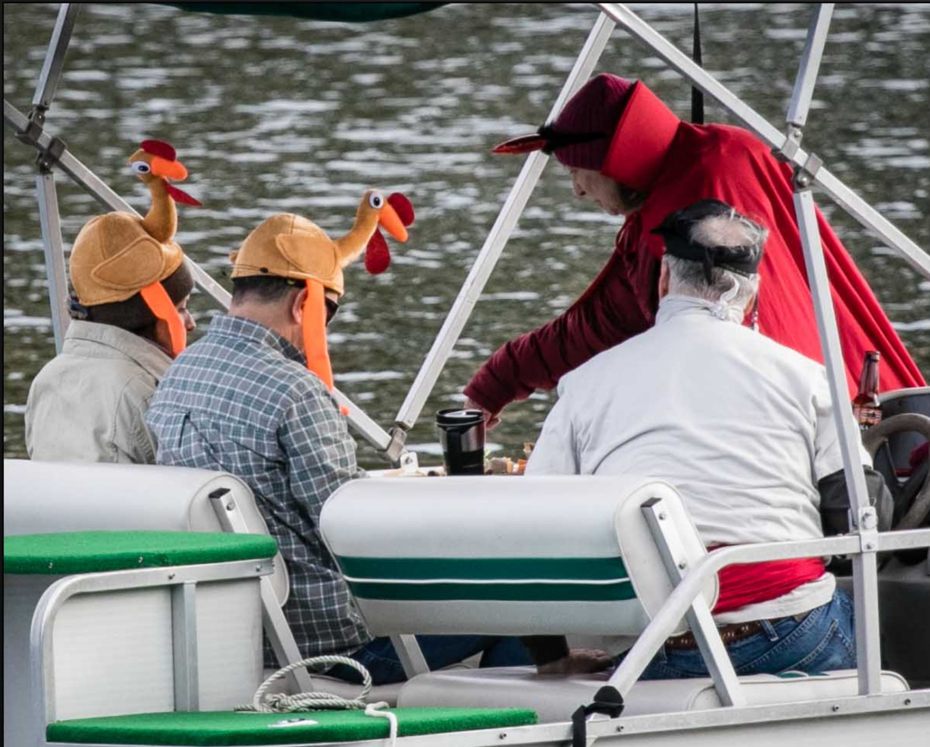
...and hot beverages