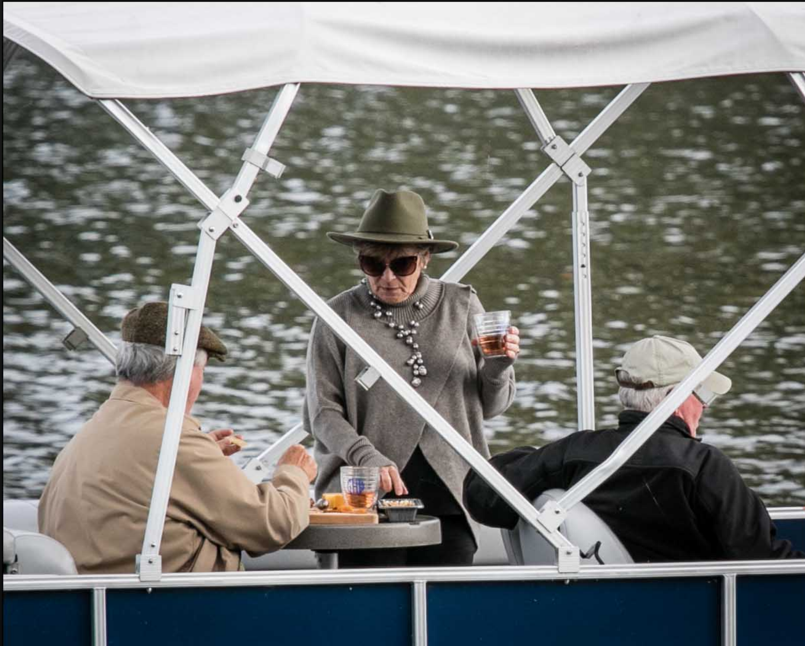
Boaters continue to arrive with snacks and beverages