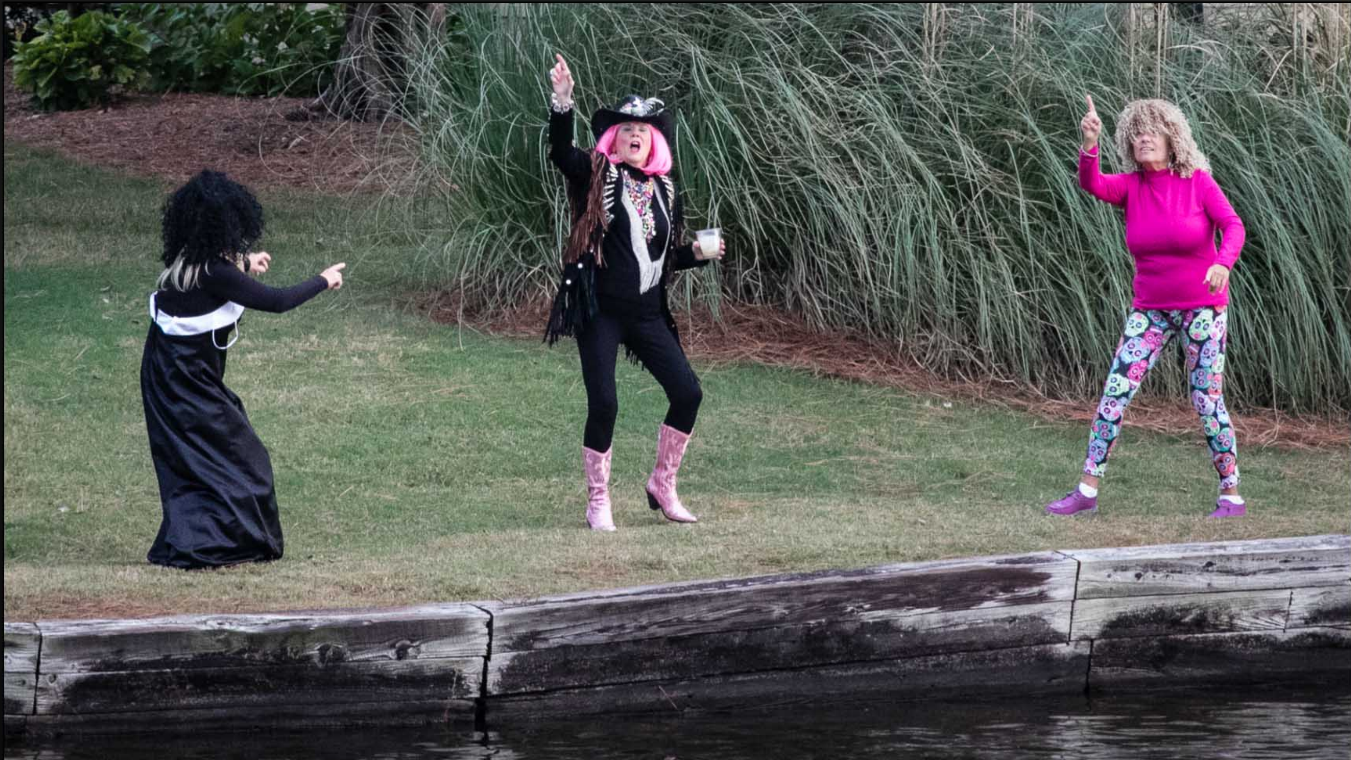
Is this the way the Supremes got started?