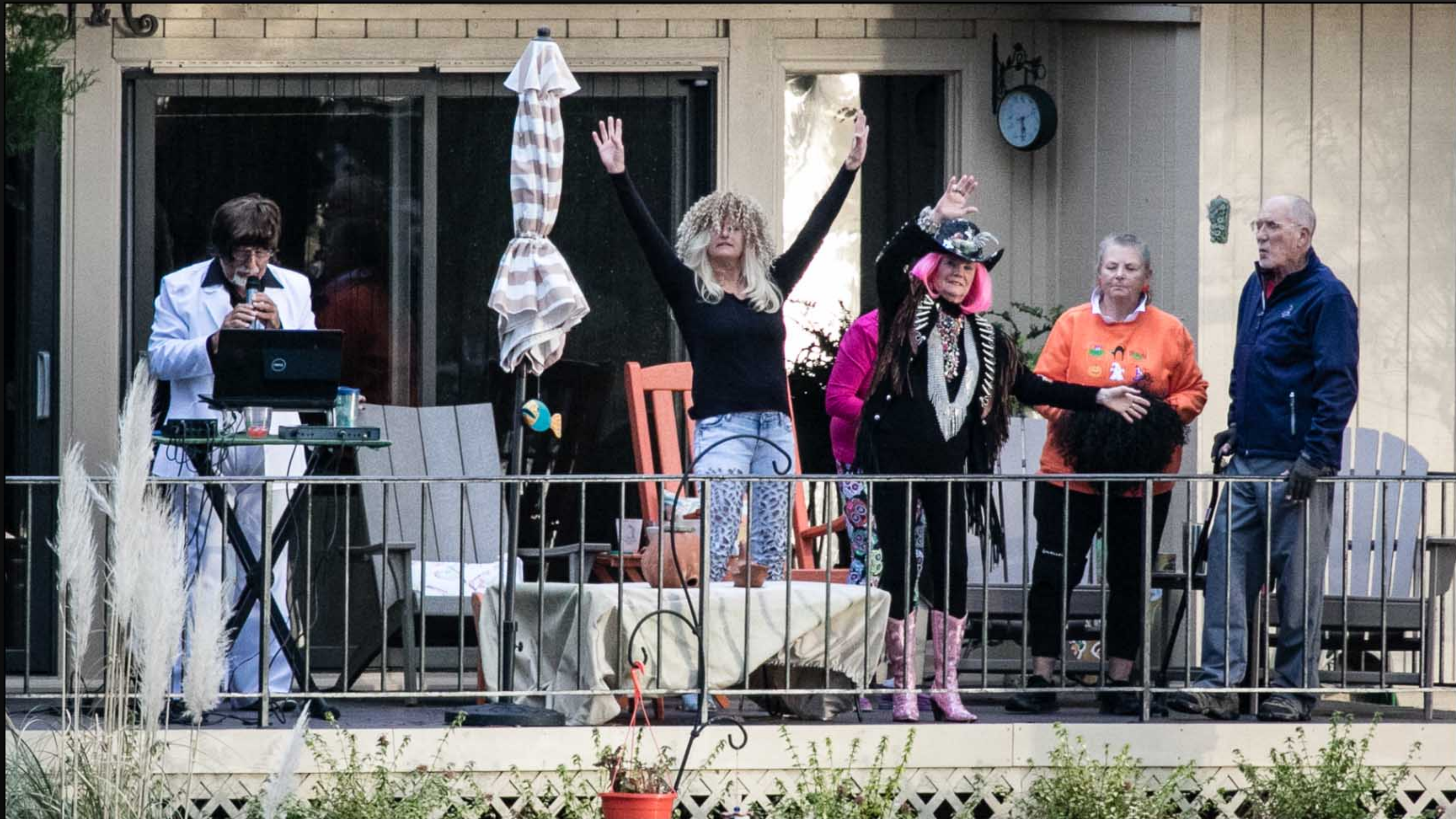
Hi Lake Pinehurst boaters, you are great