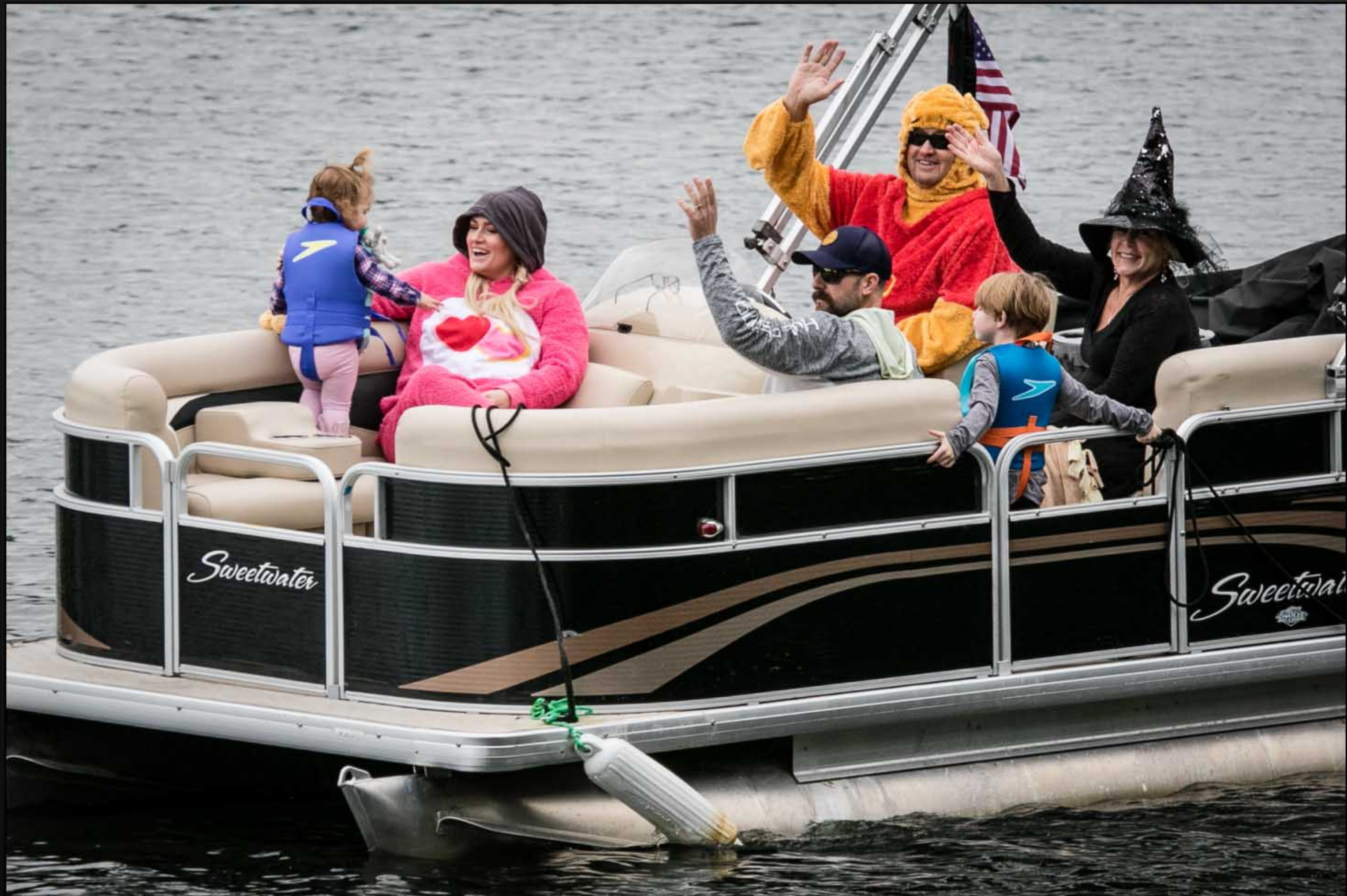
Everyone is dressed up on this boat