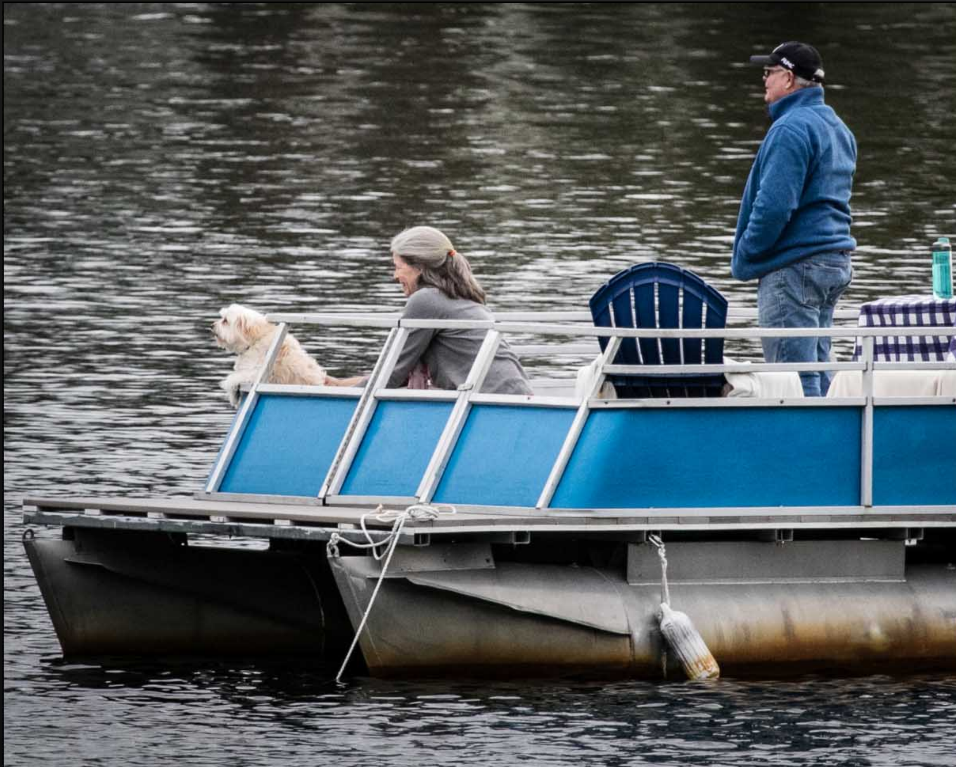
As always, we have at least one boat with a dog