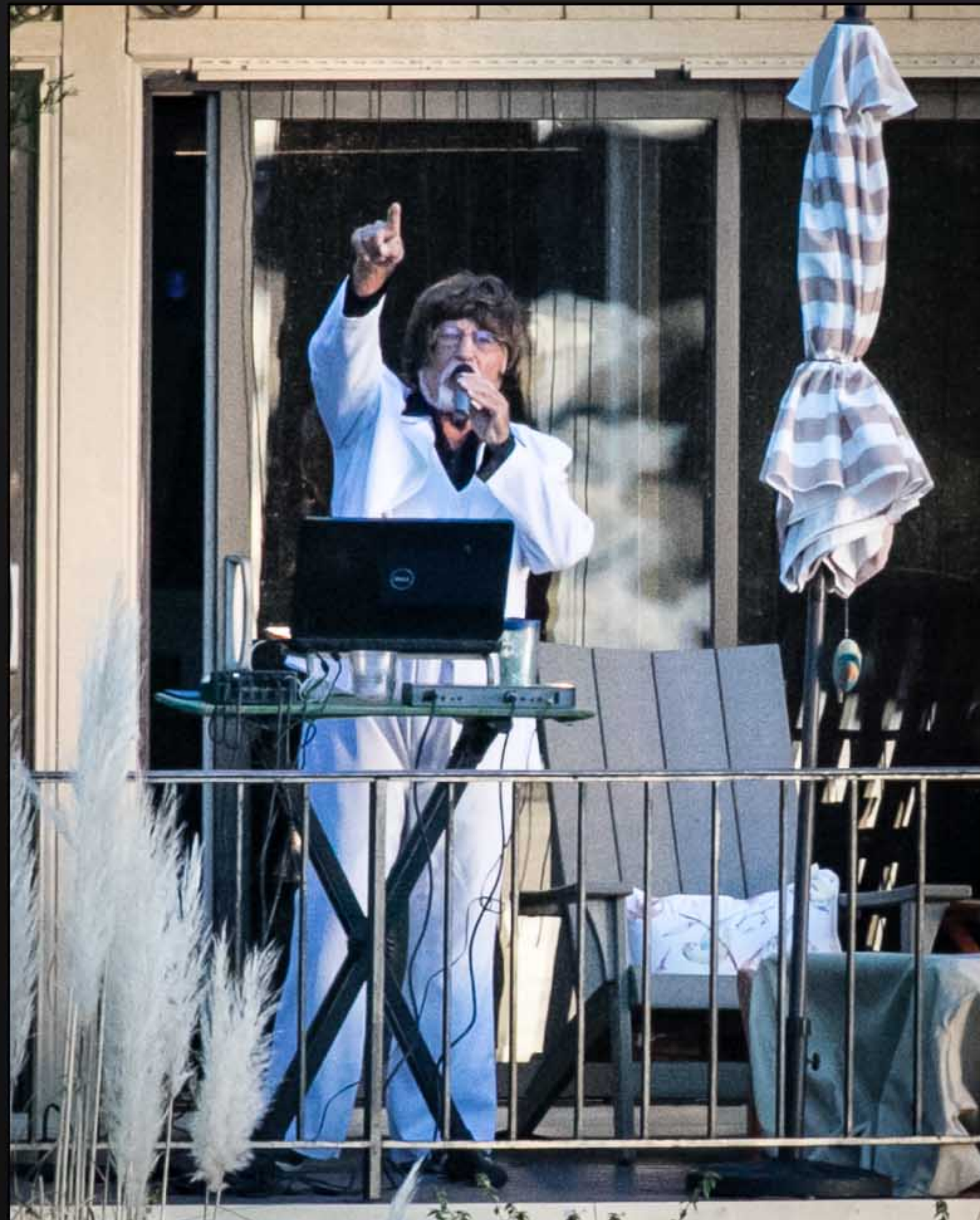
ELVIS HAS LEFT THE BUILDING