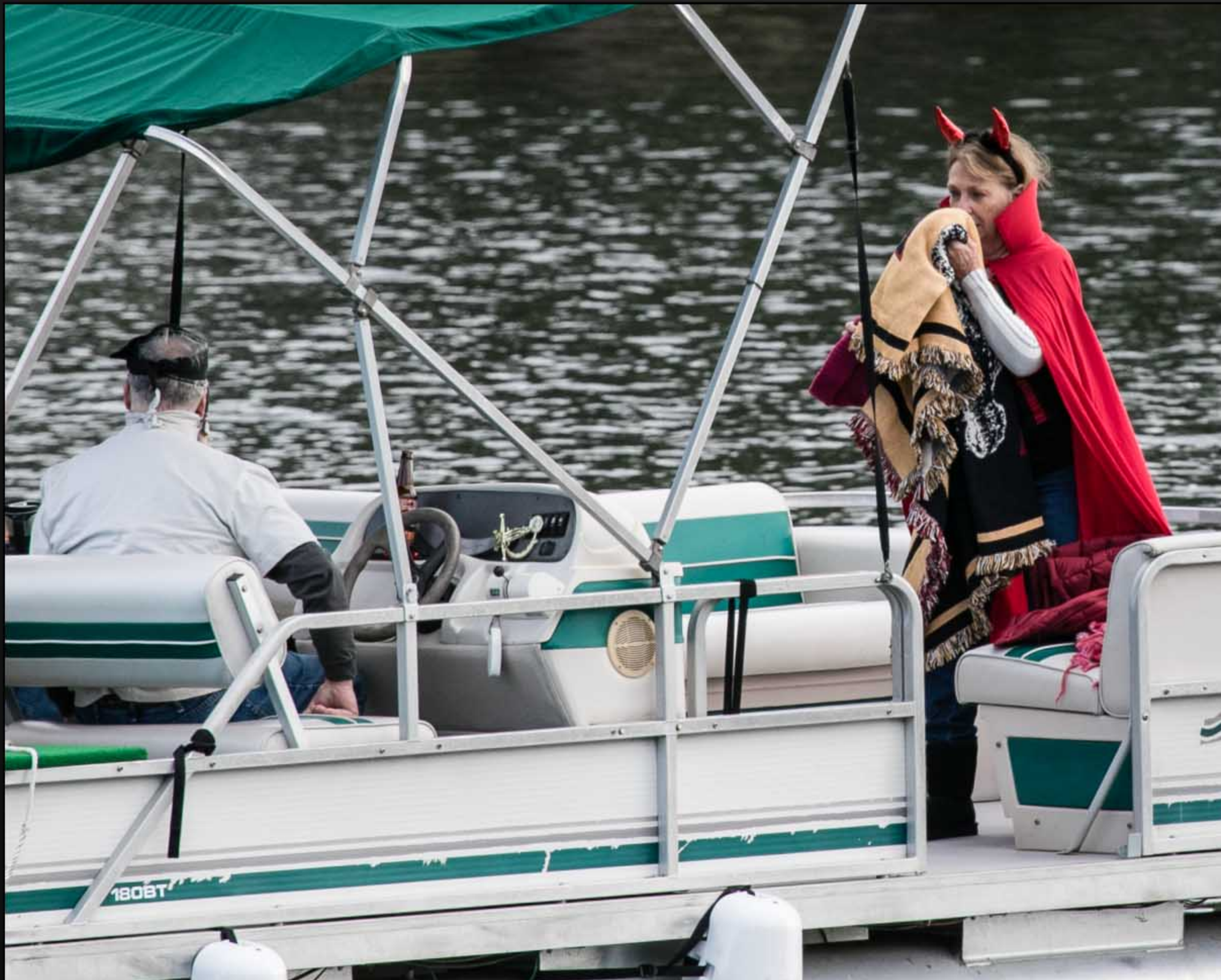
Cold and cloudy weather requires some warm costumes...