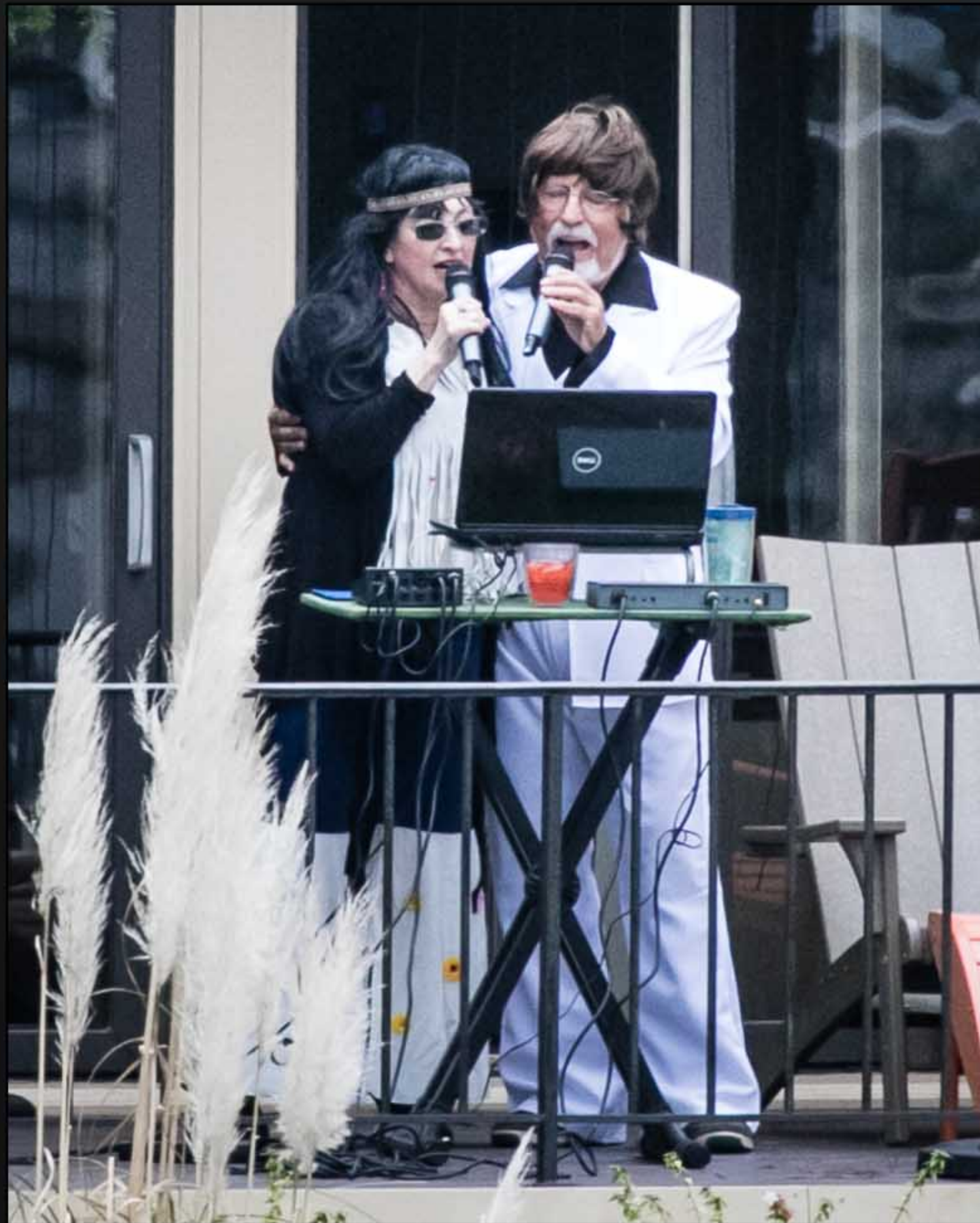
A great duet