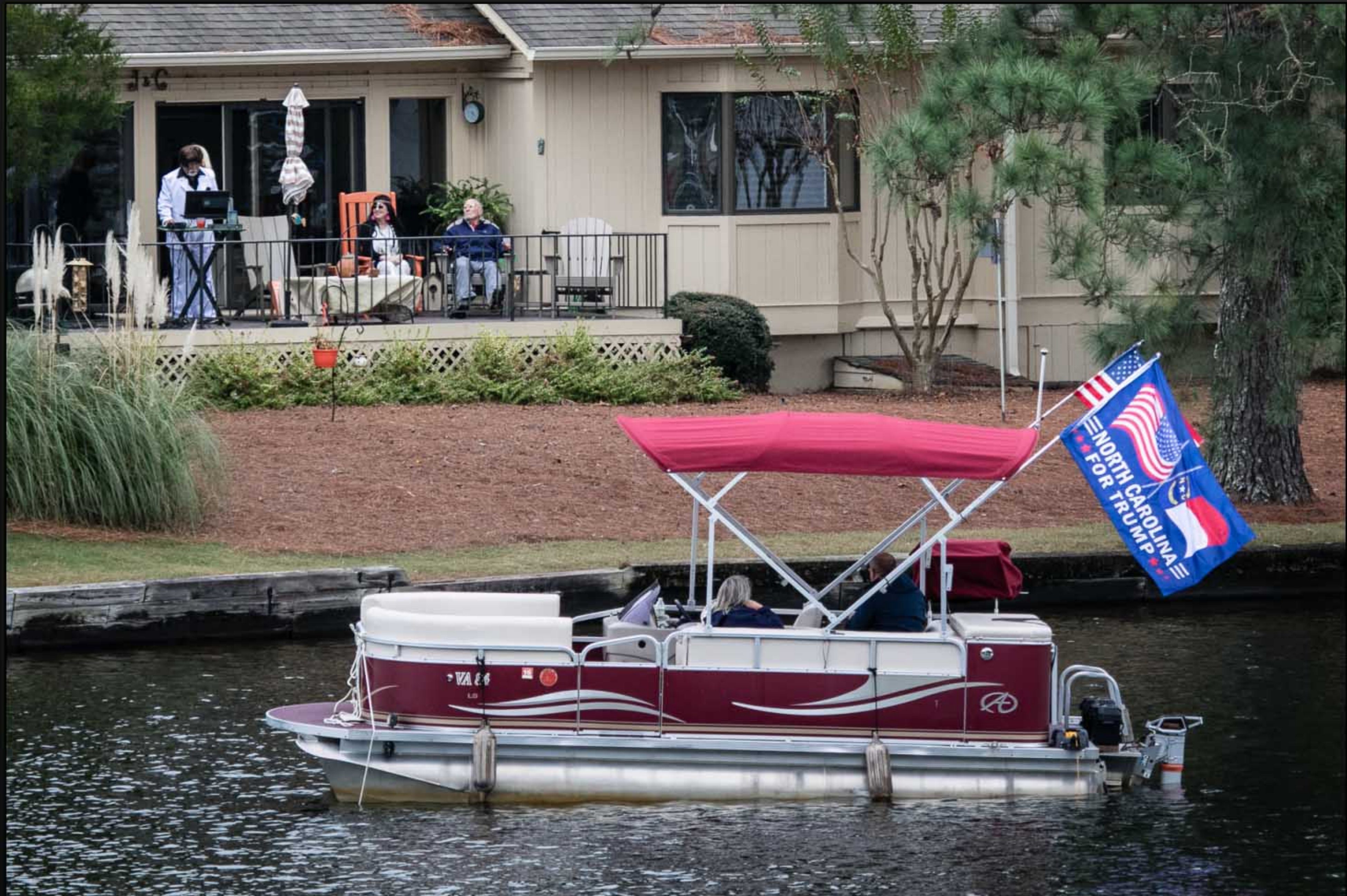
And yes, it is an election year